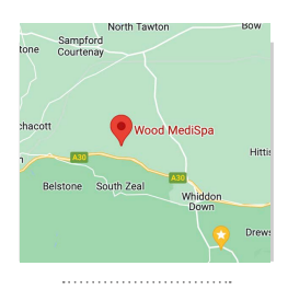
Wood MediSpa, Devon