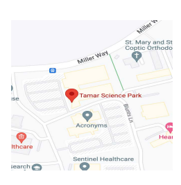
Tamar Science Park, Plymouth