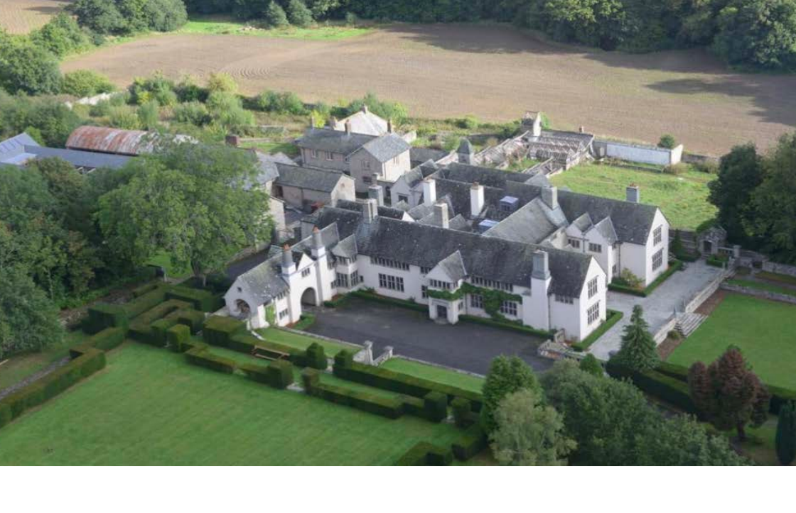
PAULWILSONAESTHETICS @ WOODMEDISPA IN DEVON